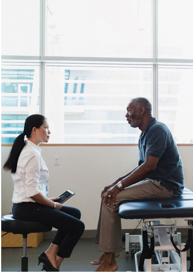
table while being examined because the tables are high and narrow, without side rails. Each experience was frightening and embarrassing for me. After several years of frightening experiences on standard tables, or exams in my wheelchair, I just avoided going to the doctor altogether unless I was very ill. (Woman with a physical disability)

It is important to recognize that the safe and effective use of accessible MDE is central to the